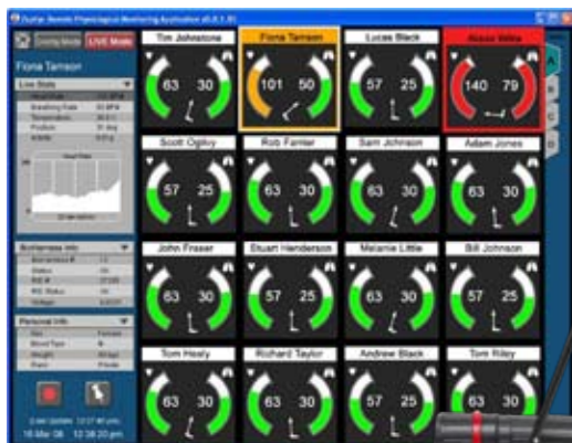
LIVE DISPLAY SHOWS ALL PLAYERS ON THE FIELD

The comprehensive data gathered combines physiological and motion-based parameters to give context to performance analysis. Zephyr's BioSense™ algorithms combine breathing rate, heart rate and activity monitoring to allow automatic detection of ventilatory threshold and heart rate recovery, while the visibility provided by the whole system also allows simple real-time interpretations for conditions such as dehydration, heat stroke risk, and fatigue.