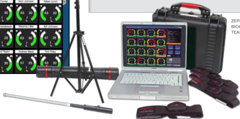
ZEPHYR BIOHARNESS™ TEAM SYSTEM